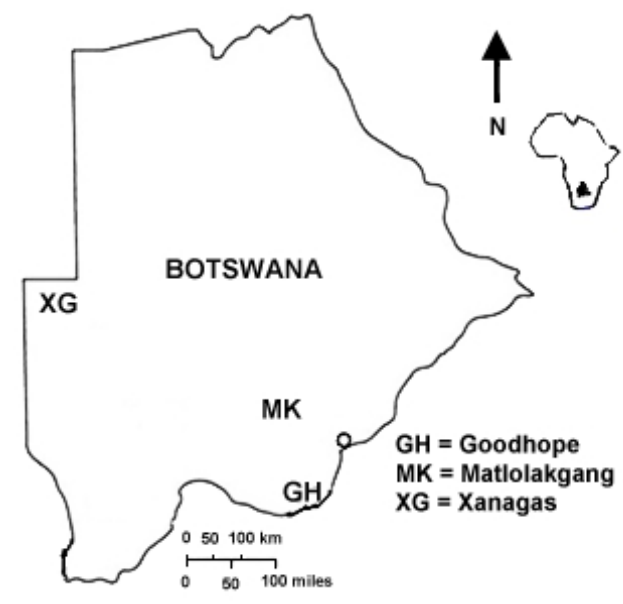
Fig. 1. Locations of the three study sites in Botswana (Matlolakgang is located between Malwele and Ngware).

Bakgalagadi, Basarwa, Baherero, Bakwena, Barolong, and other Tswana tribes); therefore, the results are likely to have wide application regionally and nationally. The three study site areas were located in savanna biome but were characterized by different biophysical features (e.g., rainfall and soil type), as described in Table 1.