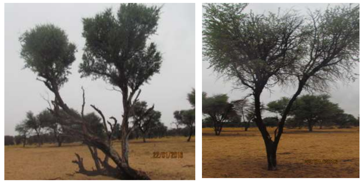
Figure 5. Common browse trees at Tsabong Eco-Tourism Camel Park: Boscia albitrunca (left), Vachellia erioloba (right)