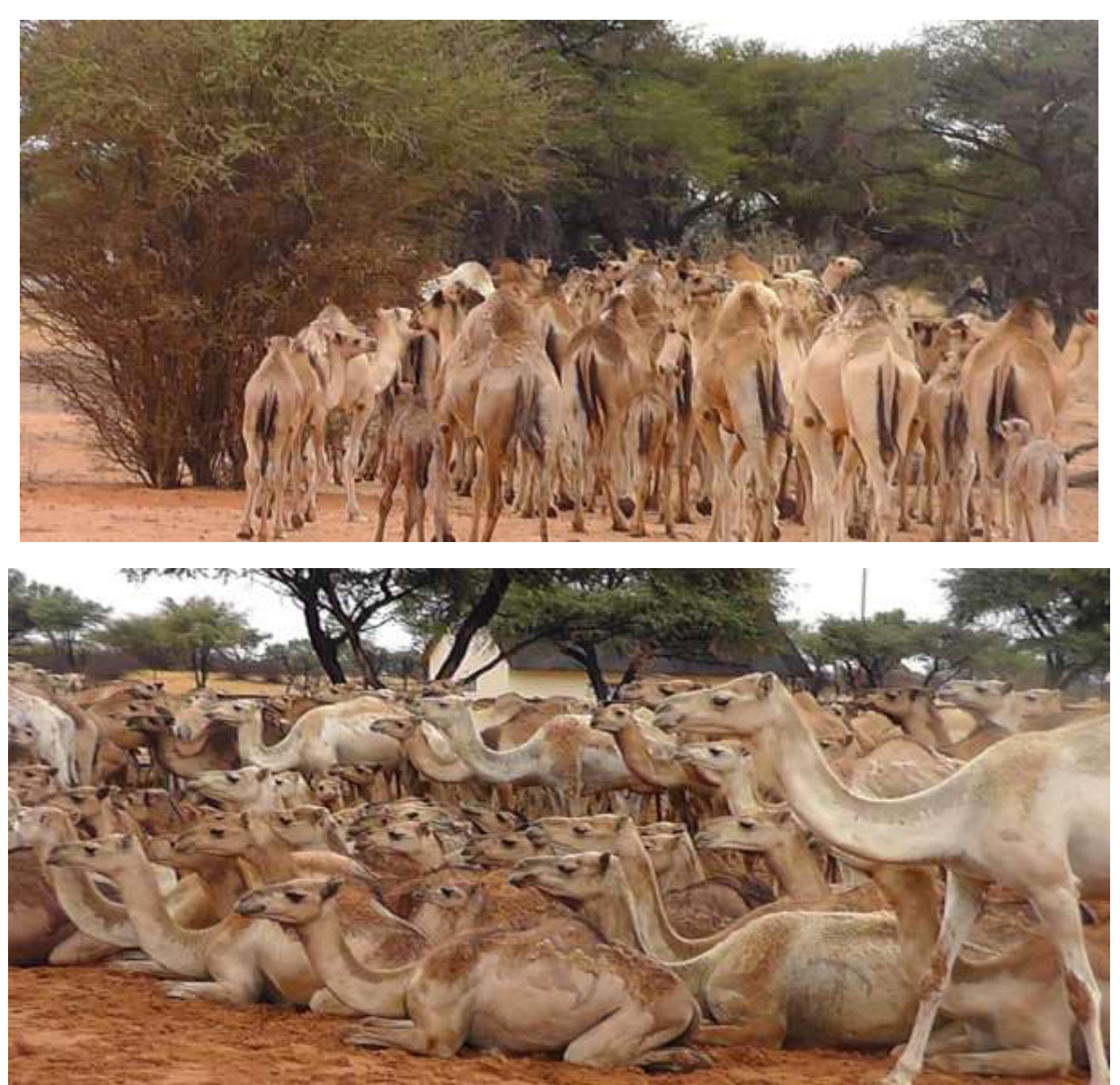
Figure 2. Part of the camel herd at Tsabong Eco-Tourism Camel Park – camels while roaming and browsing and resting