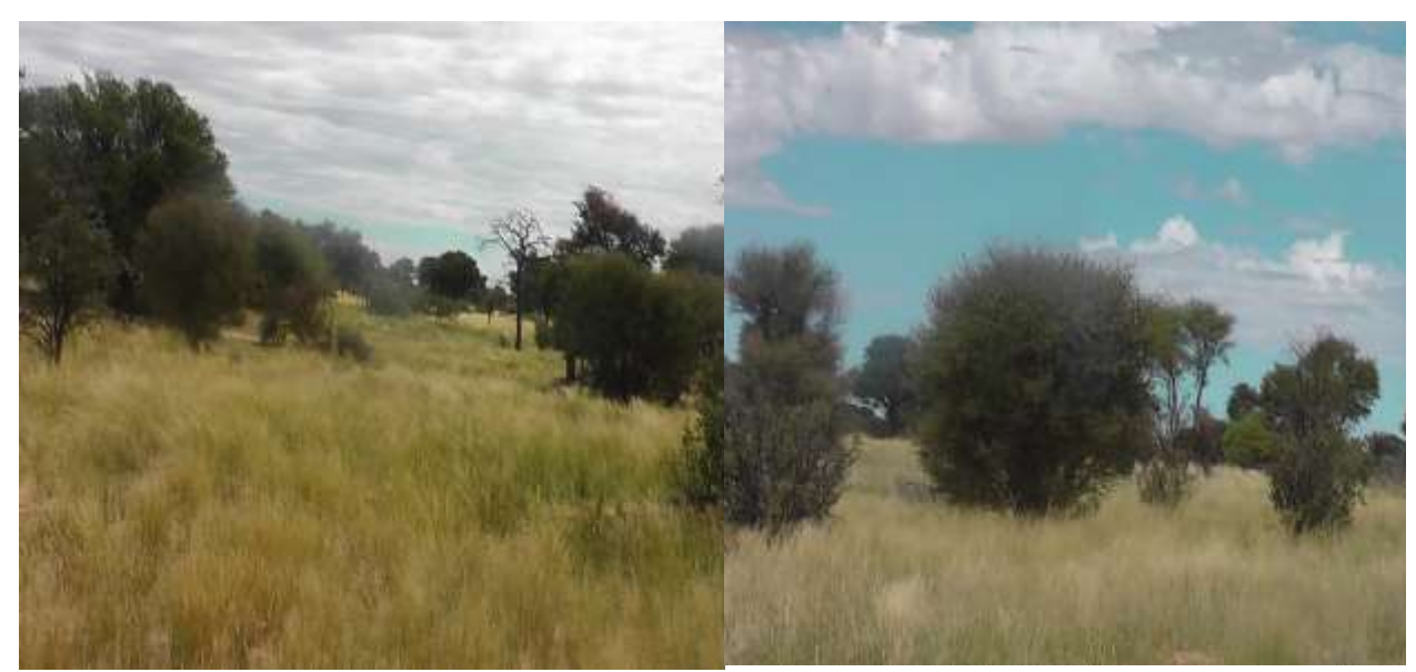
Figure 7. State of the vegetation (trees and grass) during the rainy season; March 2015