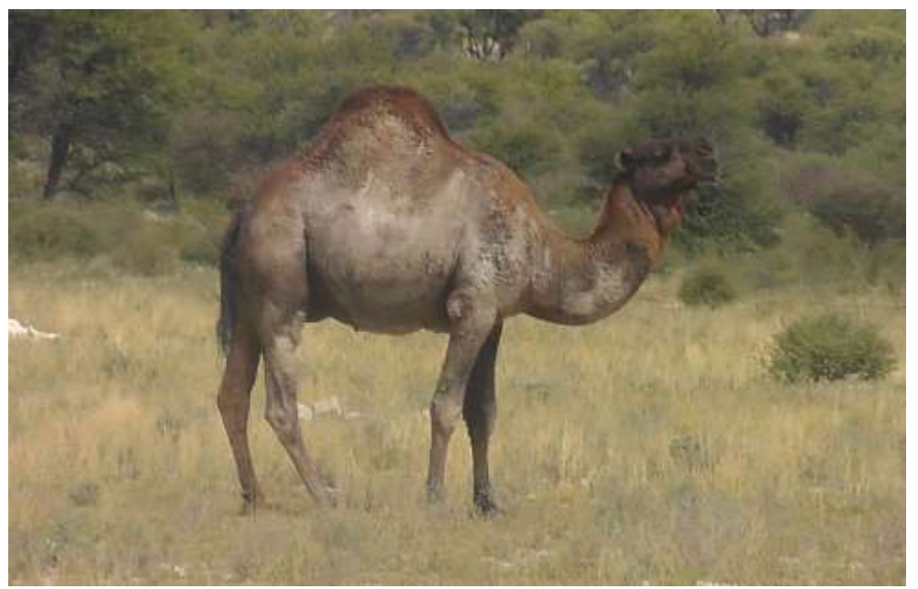
Figure 3. The black Libyan bull camel that was recently introduced into the herd

The information below shows that there are excess males in the herd than required. Considering a ratio of one male to 25 females, only six breeding males are needed and the rest should be culled/sold or slaughtered after selecting and retaining some for riding. If a very conservative ratio of male to female camels of 1:11 as suggested by Elmi (1989) is used, 14 breeding male camels can be retained in the herd. However, it should be noted that the above mentioned male to female ratio in the camel herd is recommended provided that the major breeding objective of the camels is milk production.