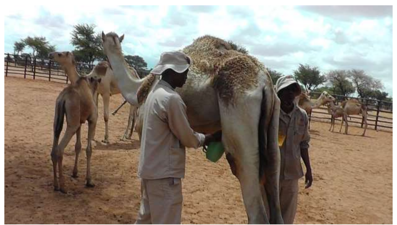
Figure 4. Hand milking of camels in an open kraal using plastic containers

However, during the rainy season, it seems vegetation is sufficient (Figure 7) as observed during a field tour of the park in March 2015.