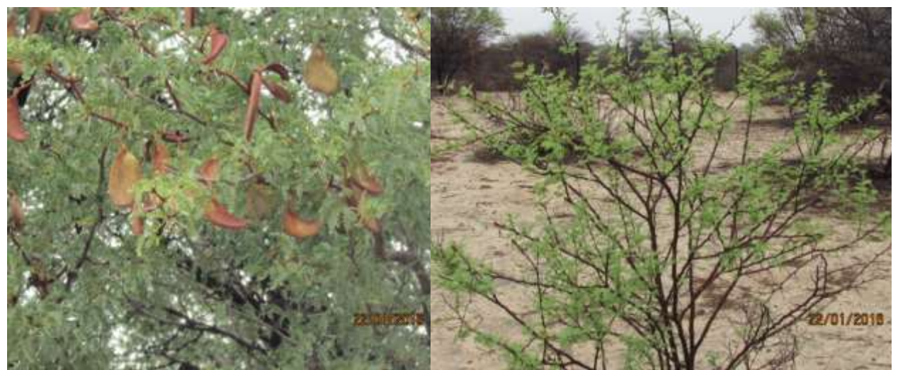
Figure 6. Vachellia erioloba with pods and Senegalia mellifera with new green shoots during the dry season